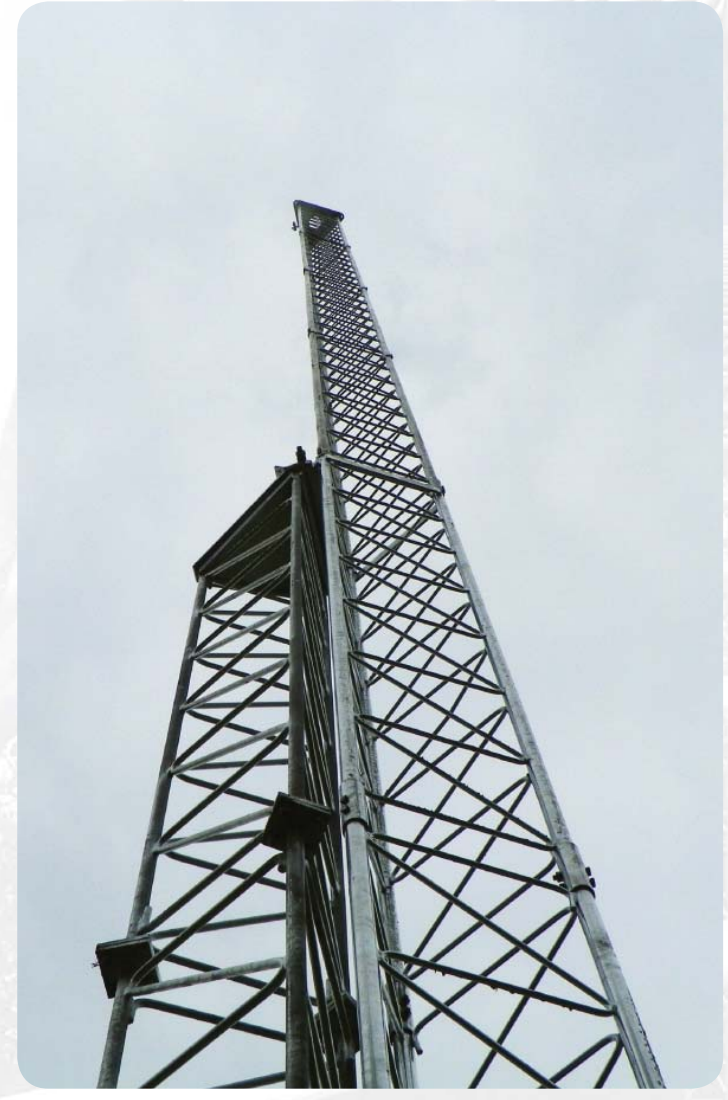
60' ROHN 55FK shown fully extended

ROHN's new design starts with a solid 45GSR base with a welded hinge at the top. A ROHN 55G tower provides the mast, extending up to 60'. The ROHN 55FK is designed to support a top load of 10 ft<sup>2</sup> EPA (Exp C, Structure class II). The design is based on 90mph winds, with no ice, and is available in several heights: 20', 30', 40' 50' and 60'.