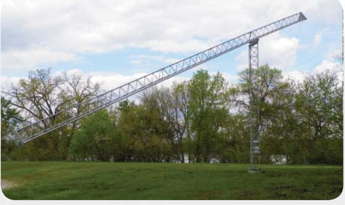
60' ROHN 55FK shown in lowered position