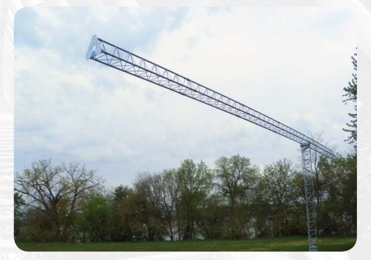
Folds quickly and easily, in a matter of minutes.